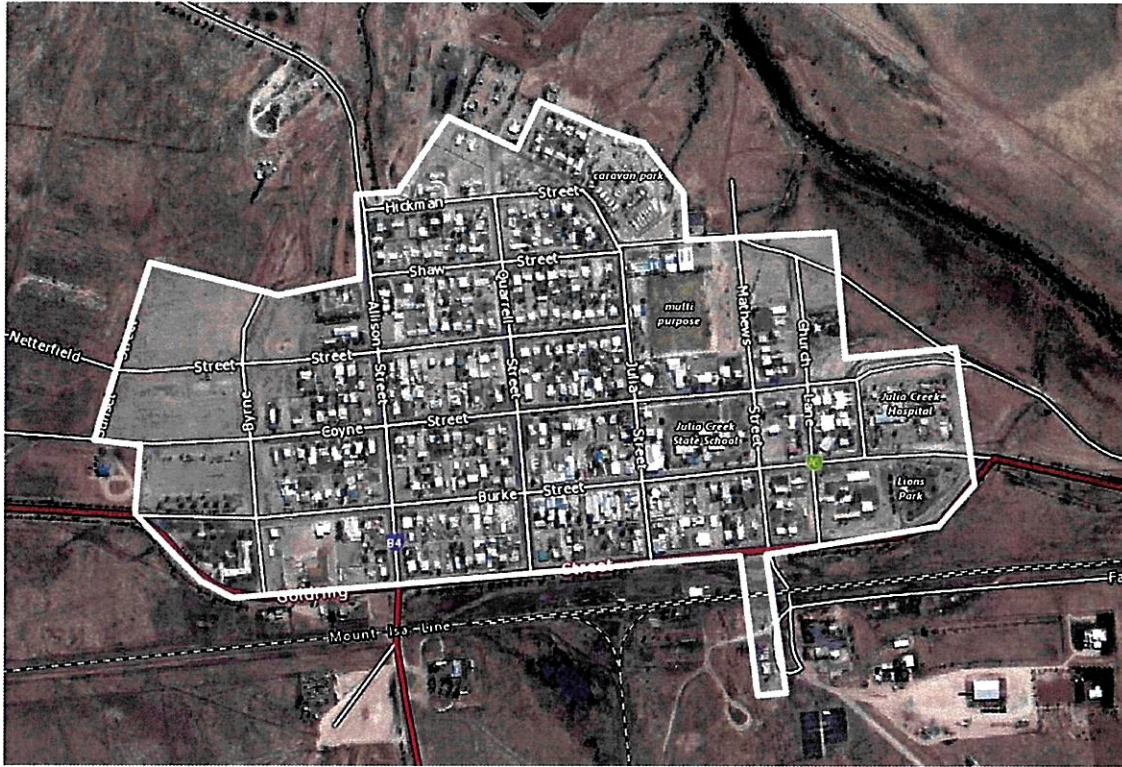
Map - Designated town area — Julia Creek

The designated town area for the township of Julia Creek is the area of Julia Creek the external boundaries of which are indicated by a bold white line.