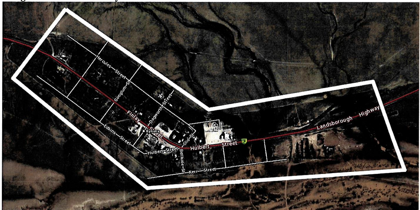
Map - Designated town area — Kynuna

The designated town area for the township of Kynuna is the area of Kynuna the external boundaries of which are indicated by a bold white line.