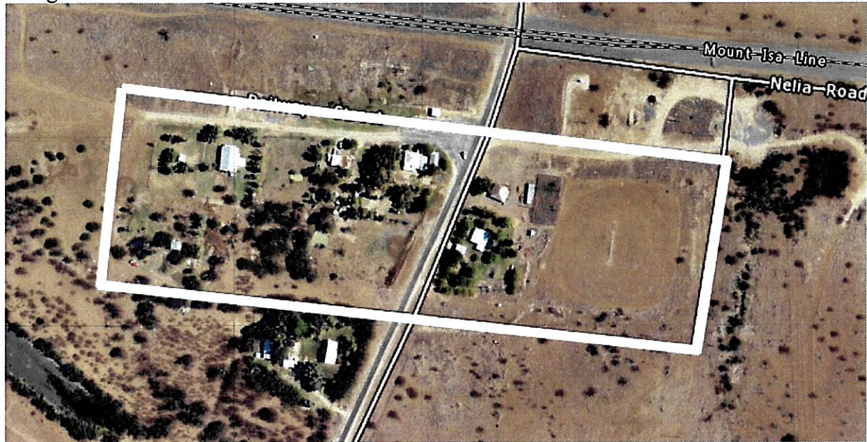
Map - Designated town area — Nelia

The designated town area for the township of Nelia is the area of Nelia the external boundaries of which are indicated by a bold white line.