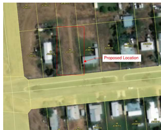
Figure 1: Project's Locality within Julia Creek, Queensland

The home shall be located on 71 Coyne Street Julia Creek, Lot 43 on JC55713. The site locality is shown below.